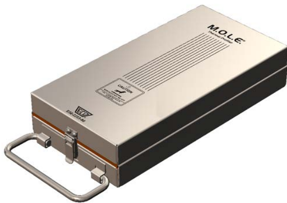
Figure 1 – External View