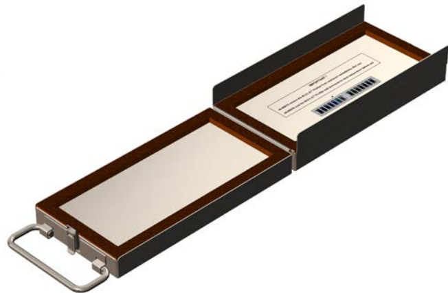
Figure 2 – Internal View